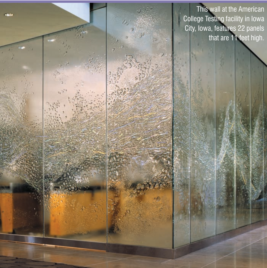
This wall at the American College Testing facility in Iowa City, Iowa, features 22 panels that are 11 feet high.

Any color imaginable and any photographic image can be applied to plate glass. Alexandra Guinan, principal of GlassKote USA, Bridgeport, Conn., that manufactures a durable color coating product for glass, says that their color system offers an