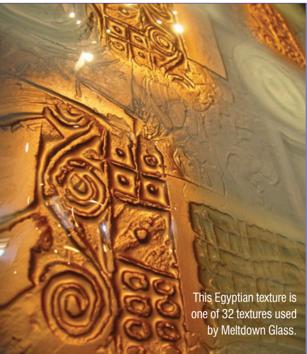
This Egyptian texture is one of 32 textures used by Meltdown Glass.