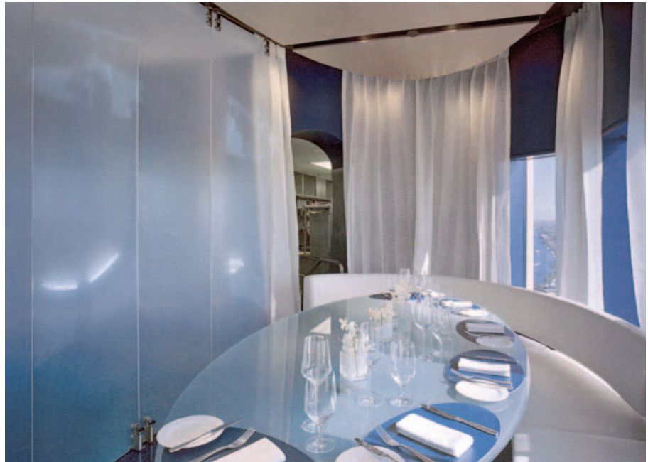
The “all glass” Cielo Restaurant won for its use of decorative glass.

Green design has become a huge trend in the architectural community, and liberal use of glass is one of the signatures of this trend. The Santa Monica Civic Center Parking Structure, designed by Moore Ruble Yudell Architects & Planners of Santa Monica, Calif., and installed by Woodbridge Glass Inc. of Tustin, Calif., took