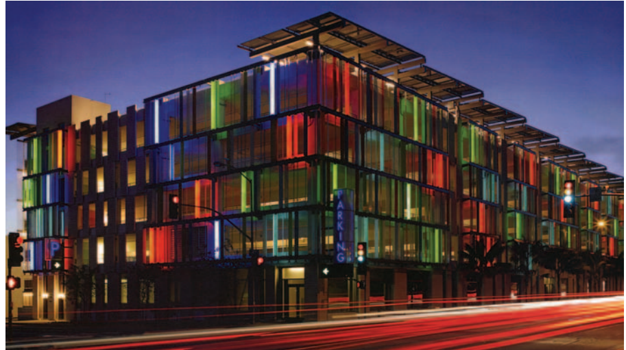
The Santa Monica Civic Center Parking Structure blended tempered and colorful laminated glass. It won the Tempered Glass—Commercial category.

judging panel. "Glass can be amazing in design in the home or business, and these winners really show that."